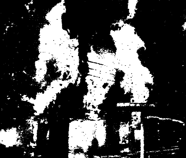
Firemen struggle to contain blaze yesterday at Robinson's department store in Singapore that killed at least 12 persons and gutted the building.

SINGAPORE (Reuter). — Firemen last night searched the ruins of a burned-out department store for the bodies of people feared killed in a five-hour blaze which sent panic-stricken Christmas shoppers fleeing into the streets.